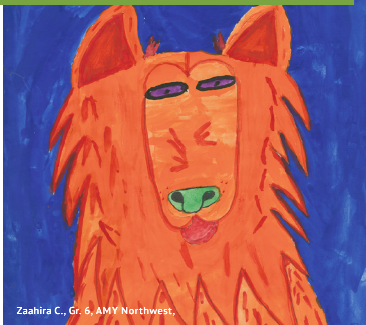
Zaahira C., Gr. 6, AMY Northwest,